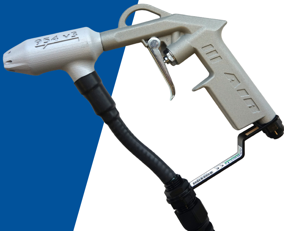
954v3 Ionising Air Gun